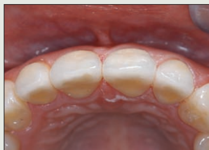
Figure 8: Lingual view of the maxillary anterior teeth.