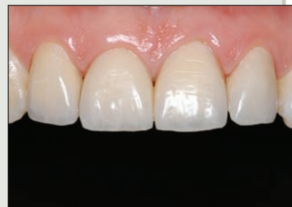
Figure 3: Facial view of the patient after insertion of provisional restorations. Teeth 11 and 21 exhibit a discrepancy of the gingival line.