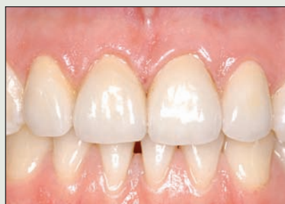
Figure 5: Close-up view of the 4 Procera AllCeram crowns after cementation.