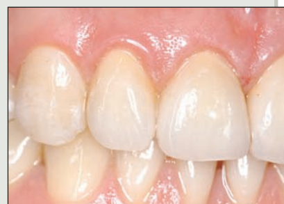
Figure 6: Intraoral facial view of teeth 11 and 12.