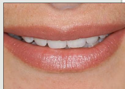
Figure 9: Final result. There is excellent colour-matching with the rest of the teeth and superior lifelike esthetics.

cement (TempBond NE, Kerr, Romulus, Mich.). Upon completion of the provisional treatment stage, the patient underwent periodontal therapy to correct the gingival line and to ensure even crown length and gingival margins of the 2 central incisors (Fig. 3)