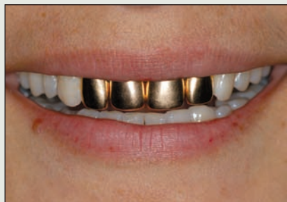
Figure 1: Maxillary anterior teeth of a 28-year-old woman with full gold crowns.